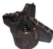
4-wing bits with buttons